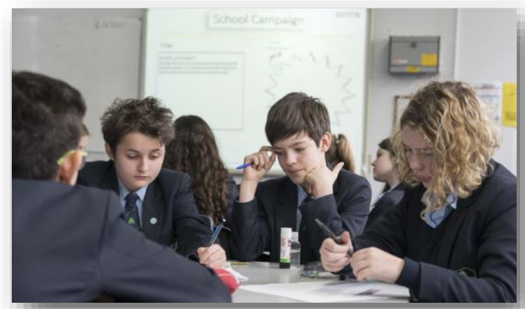
DBS disclosure and pre-employment checks.

The SEN Department at the school is fully committed to supporting the needs of pupils who experience learning, behavioural or emotional difficulties. We offer a wide provision of intervention and support encompassing literacy, numeracy, speech and language, social skills, anger management and individual mentoring.