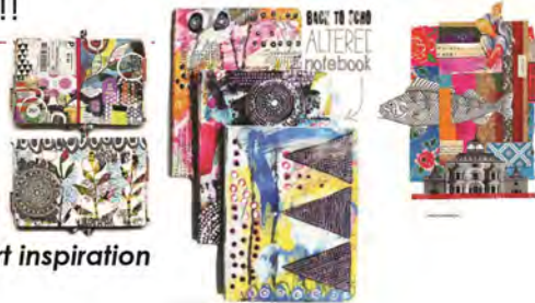
Fine Art inspiration

We would like you to design the front cover of the planners for next year?